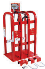
EL-X Express Lane® Inflation System (PN 85607770)