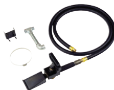
Auxiliary Bead Sealer (ABS) (PN 85606545)