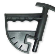
Manual Drop Center Tool (PN 8435685)