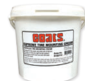
Paste Lube Bucket (PN 8183710)