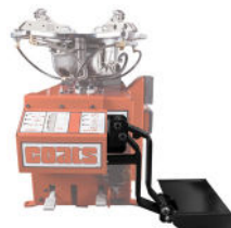
Point-of-Use Lift System (PN 85608609)