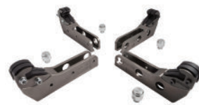
Grip-Max® Plus 28" Clamps (PN 85607986)