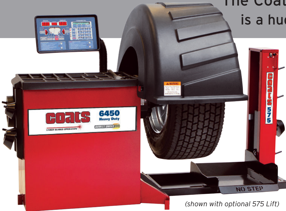
(shown with optional 575 Lift)

The Coats 6450 Series is a huge step forward.