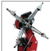
Clamp Extensions 9299270