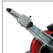
Alloy Rim Protectors 9299272