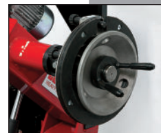
Post and cone detail >>