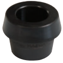
DOUBLE SIDED MAZDA COLLET (PN 85611072)