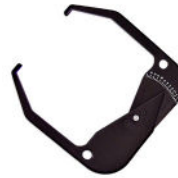
CALIPERS (PN 8309011)