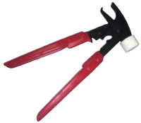
WHEEL WEIGHT HAMMER (PN 85607780)