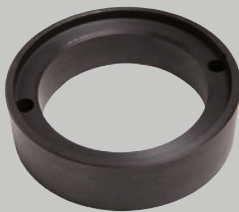
LIGHT TRUCK BACK CONE SPACER (PN 8111935)

Eliminates the need to use a faceplate extension and a spacer cone when mounting wheels in certain light truck/SUV applications. (Toyota, Land Cruiser, Sequoia, and some Nissan light trucks)