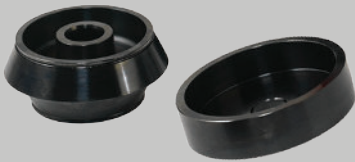
LT. TRUCK CONE KIT (PN 8113277C)

Eliminates the need to use a faceplate extension and a spacer cone when mounting wheels in certain light truck/SUV applications. (Toyota, Land Cruiser, Sequoia, and some Nissan light trucks)