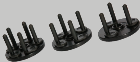
ADJUSTABLE PIN PLATES (PN 85610104)

Extends the diameter of the faceplate to allow larger cones to be mounted behind the wheel. Back cone mounting is critical for balancing wheels with a cosmetic center or clad face.