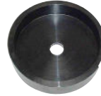
BACK CONE SPACER (PN 85009089)