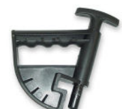
MANUAL DROP CENTER TOOL (PN 8435685)