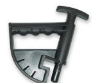
MANUAL DROP CENTER TOOL (PN 8435685)