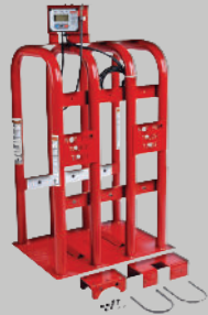
EL-X EXPRESS LANE® INFLATION SYSTEM (PN 85607770)

Eliminates the inflation process wait time on the tire changer resulting in faster bay turns and reduced customer wait times.