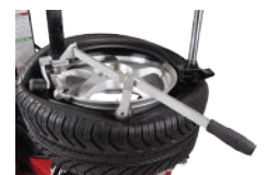
MANUAL BEAD DEPRESSOR & DUCKHEAD® ROLLER (PN 85609077)

Provide a standard external clamping range of 16" up to 28", allowing the convenience of working on a multitude of tire assemblies.