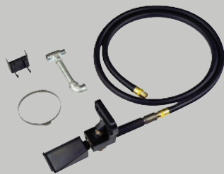
AUXILIARY BEAD SYSTEM (ABS) (PN 85606545)

The Coats® Point of Use Lift System helps you elevate heavy tire and wheel assemblies up to tabletop height with minimal effort.