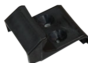
STEEL CLAMP INSERTS (10) (PN 8183604)

Combo design insures the bead stays in the drop center and tire bead does not roll back over the Duckhead® mount/demount tool.