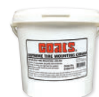
PASTE LUBE BUCKET (PN 8183710)