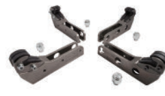
GRIP MAX® PLUS 28" CLAMPS (PN 85607986)

Offers twice the slip resistance than the traditional clamps and built in rim protectors eliminate metal on metal contact.