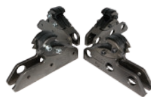
GRIP MAX® PLUS CLAMPS (PN 85607787)

Offers twice the slip resistance than the traditional clamps and built in rim protectors eliminate metal on metal contact.