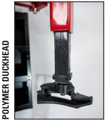
Tool used for mounting and demounting tires without damaging the rim.