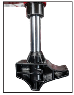
Tool used to push the tire bead into the drop center of the rim, allowing for effortless mounting and dismounting of the tire.