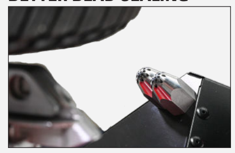
Dual Nozzle Bead Sealer

Seal difficult assemblies with ease with more air, more quickly.