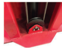
3/8" / 76mm Non Fatigue Equalization Cables and 5" / 127mm Steel Pulleys