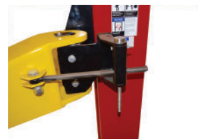
Self Activating Arm Restraints