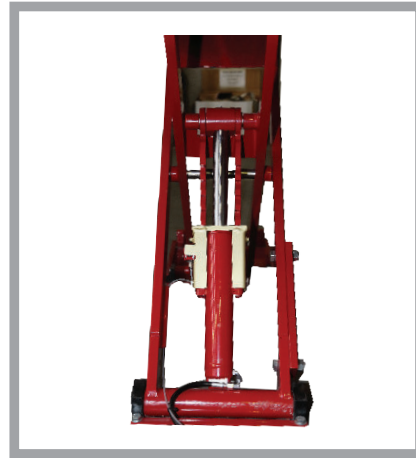
Air Release Mechanical Locking