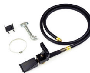
Auxiliary Bead Sealer (ABS) (PN 85606545)