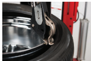
Leverless Upgrade (PN 85607471)