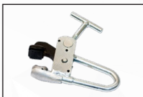
G-Clamp (Alloy Wheels) #89299271