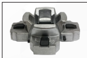
Clamping Protector for Alloy Wheels (Set of 4) #89234826