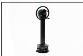
Wireless Remote #89238598