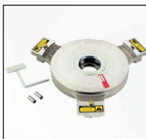
Dayton Standard Center Adapter