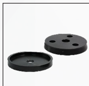
Hub Centered Cone Kit