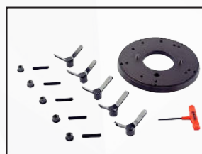
Stud Piloted Budd Adapter