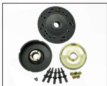
Heavy Duty Truck Kit for 50mm Shaft