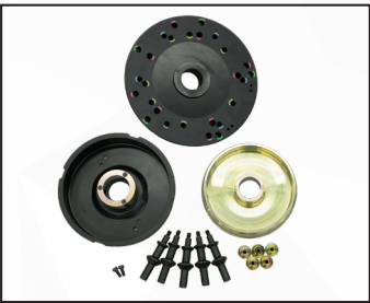
Heavy Duty Truck Kit for 50mm Shaft #8302010510

Included with 6450 Balancer Kit. Comes with spacer disk, collet, pin plate, 2 screws, 5 pins with thumb nuts