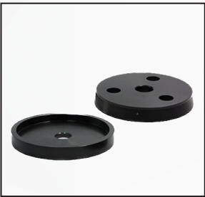
Hub Centered Cone Kit #8109877