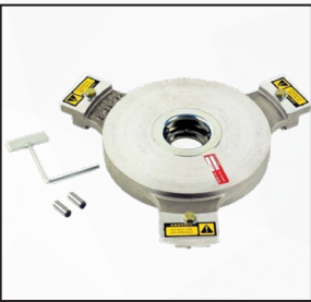
Dayton Standard Center Adapter #8110785