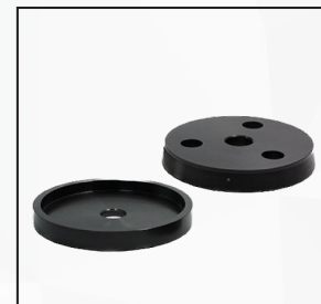
Budd Cone and Backing Plate Kit

Included with 6450 Balancer Kit. Comes with Small Cone, Large Cone, and Truck Cone.