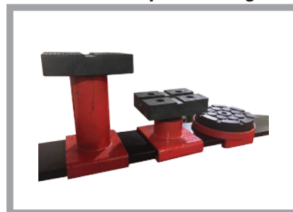
Mid Rise Adapters