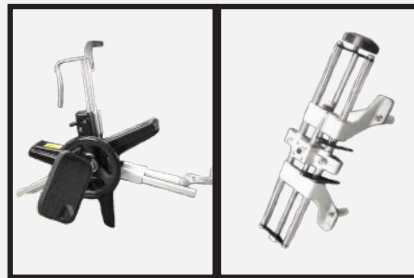
TWO TYPES OF CLAMPS