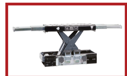
(780mm to 1500 mm) Telescoping arms reach 30 3/4"