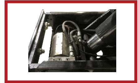
Heavy duty low maintenance pump