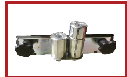
Plated controls & height extensions