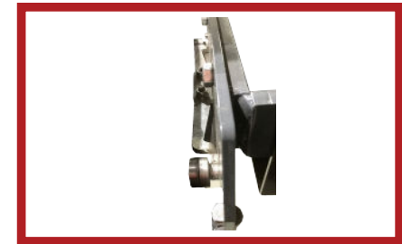
Stainless steel suspension & rollers