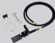
Free Auxiliary Bead Sealer 85606545

800MAXX90220 Elec. 220V, Hand / Foot Controlled 800MAXX90A Air, Hand / Foot Controlled