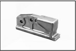
Jaw Extension for HIT5000 and HIT9000