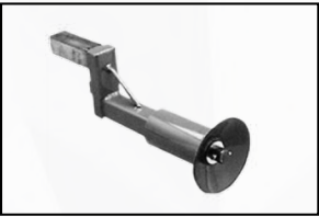
Offset Disc and Holder Tool